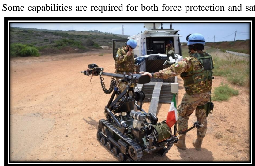
EOD equipment in use in UNIFIL

Some capabilities are required for both force protection and safety and security of peacekeepers, as well as to better implement mandated tasks with high end capabilities in higher threat environments. T/PCCs must be capable of adjusting their units or generate independent units. Explosive Ordnance Disposal (EOD) Units/capabilities are required to contribute to the missions' overall capacity to respond to an increasing EOD threat, especially from Improvised Explosive Devices (IED), impacting freedom of manoeuvre and the safety and security of peacekeepers. UNIFIL have requested additional EOD capabilities that are being supported by deployed TCCs. Disposal of unexploded ordnance, improvised explosive devices, booby-traps and abandoned