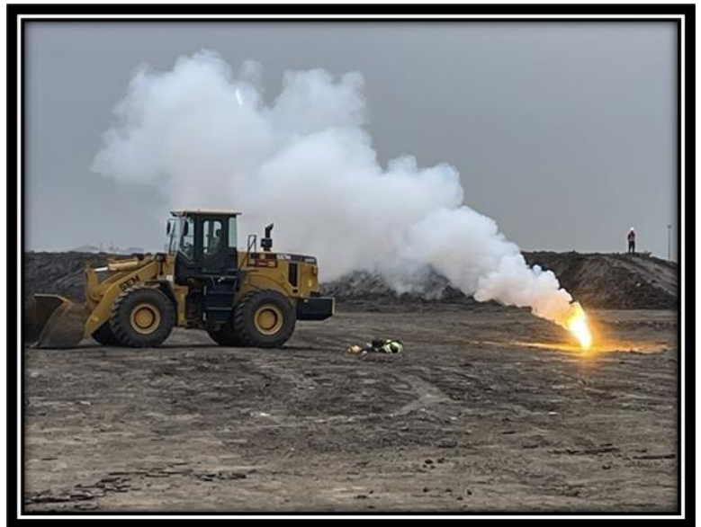
Demonstration of explosive hazard response skills during the EHAT + FMAC + HEE integrated training in Cambodia

The Triangular Partnership Programme (TPP) enhances uniformed peacekeepers' capacities for UN Peacekeeping Operations, as well as African Union Peace Support Operations, through the provision of training and operational support in four distinct projects: 1) Engineering 2) Medical 3) C4ISR (Command, Control, Communications, Computers (C4), Intelligence, Surveillance, and Reconnaissance (ISR)) and camp security technologies, and 4) Telemedicine. Following the successful pilot, conducted with supporting Member States and the UN Mine Action Service (UNMAS) in Kenya from 17 June to 26 July 2024 the TPP will also integrate Explosive Hazard Awareness Training (EHAT) into future engineering and medical pillar courses in line with broader A4P+ objectives to improve safety and security outcomes for UN peacekeepers. As part of these efforts, the TPP conducted a cross-pillar, cross-national training pilot in Cambodia from 18 November to 20 December. This integrated training combined EHAT, the Field Medical Assistants Course (FMAC), and Heavy Engineering Equipment (HEE) operations into a scenario-based final exercise. The TPP is also working towards expanding thematic training areas, to include mainstreaming environmental considerations in peacekeeping and peace support operations.