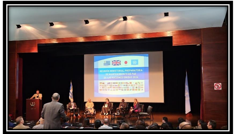
Montevideo Ministerial Prep-Meeting 10 and 11 December 2024

The UN Peacekeeping Ministerial 2025 in Berlin is an important opportunity for Member States to demonstrate high-level support for peacekeeping by making concrete capability pledges. Leading to this major event, the first preparatory meeting was recently held in Uruguay, where Member States had an opportunity to learn more about UN peacekeeping needs and discuss ideas in areas related to training, capacity building, protection of civilians and UN police. Two additional preparatory meetings are planned, for 4-5 February 2025 in Jakarta on the Future of Peacekeeping, New Models and Related Capabilities, and in April 2025 in Islamabad to discuss Safety and Security of Peacekeepers, including technology.