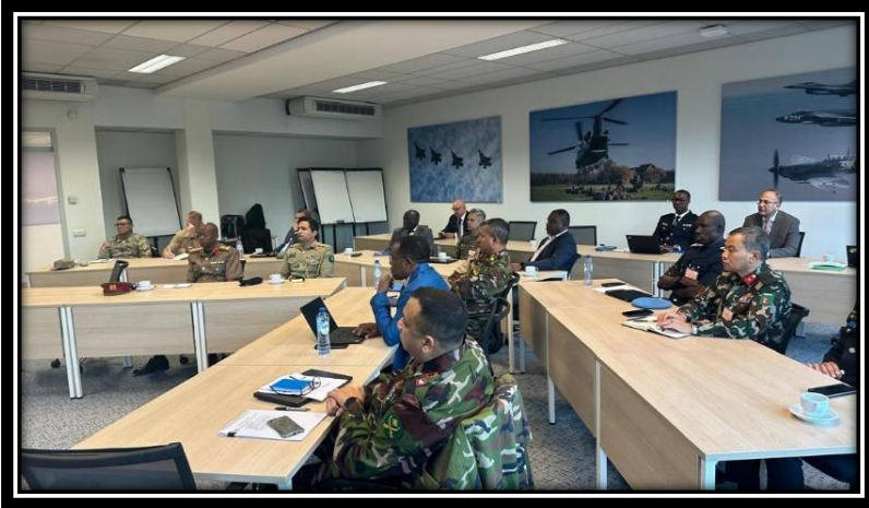
RDL Workshop conducted in the Hague, Netherlands

The PCRS Rapid Deployment Level (RDL) is critical in allowing the Secretariat to promptly respond to any new immediate requirements from existing missions and to support plans for the quick start-up of a new mission. Current vacancies on the RDL include: one special forces company, one medium utility helicopter unit, one unmanned aerial system unit, one airfield support unit, and one combat convoy company.