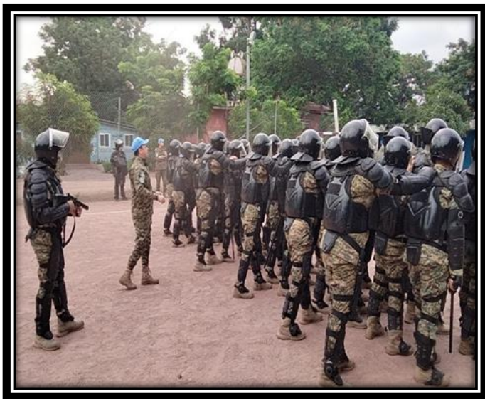
MONUSCO FPU Rio Control training

Formed Police Units (FPU) are the core of uniformed police capabilities in UN missions. They should be equipped with relevant capabilities, such as SWAT, rapid reaction, canine and/or riverine elements (e.g., two FPUs at rapid deployment level require SWAT capabilities, one of them being francophone). A platoon size of women in each FPU remains essential.