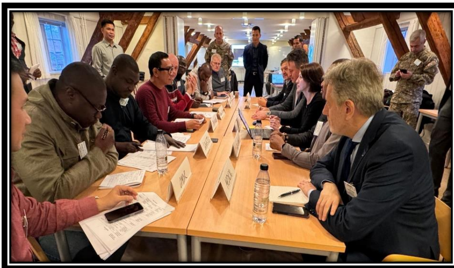
MOU Negotiation Exercise during the UN Senior National Planners Course in Denmark