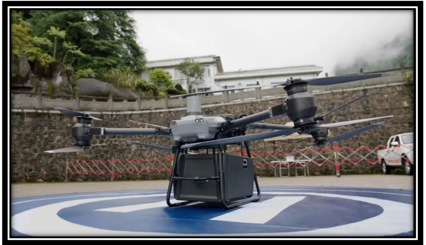
Heavy duty drone for cargo transportation

Tactical Transport Fixed-Wing Aviation Units are very important elements to provide flexibility and rapid response, extend the missions' footprint, and increase the missions' ability to support components deployed in locations that cannot be sustained by roads. Unmanned Aircraft Systems (UAS) tend to be needed in the mid to long-term as critical Intelligence, Surveillance, and Reconnaissance (ISR) tools that are part of the UN peacekeeping-intelligence (MPKI) architecture and also to minimize risk in logistic activities. Key for supporting ground units are Class 1 micro-UAS , which are lightweight and compact in nature. These can be deployed and re-deployed easily to observe incidents in real time, monitor safe demilitarized border zone, detect civil intrusions into buffer zones, detect/deter illegal activities, conduct surveillance of opposing forces positions, help protect peacekeepers and map/record terrain changes. The Secretariat is studying the use of UAS for delivery of cargo and medical supplies, emergency response or environmental monitoring.