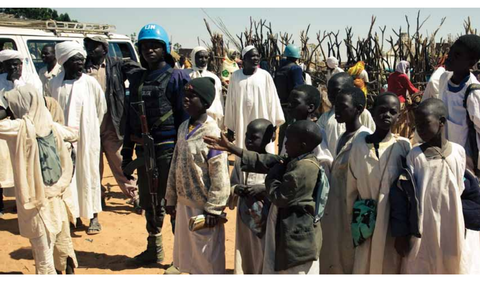
The Sudan: Children during a visit of the Special Representative of the Secretary-General Coomaraswamy to internally displaced persons camp in Darfur.