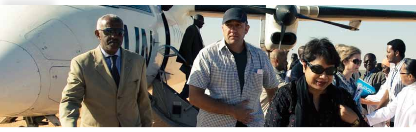
The Sudan: Special Representative of the Secretary-General Coomaraswamy on her mission to the Sudan to witness the signing of an action plan with the SPLA.