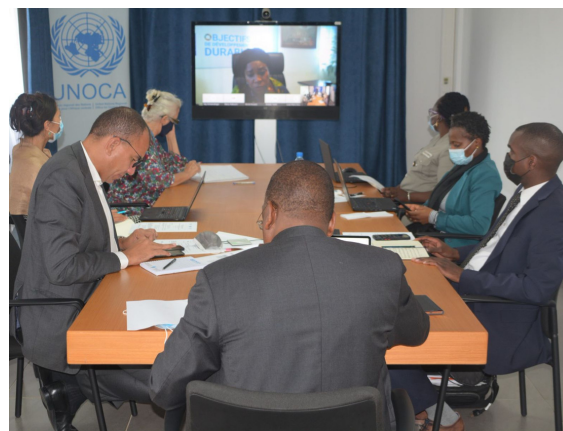
Libreville. The OROLSI scoping mission identified concrete areas of support on rule of law and security institutions needed or requested by UNOCA, ECCAS, and United Nations Resident Coordinators (RCs) in Central Africa.

The JCSC joined a scoping mission to UNOCA in Gabon (May – June 2021) with the Standing Police Capacity and the OROLSI Disarmament, Demobilization and Reintegration Section. In partnership with the Department of Political and Peacebuilding Affairs, the deployment strengthened the engagement of OROLSI on conflict prevention, including at the regional level. An assessment report was produced identifying key areas requiring rule of law and security support in the Central African region including: democratic and electoral governance; security governance; climate change/security; as well as country-specific challenges and opportunities for OROLSI support through UNOCA in Member States of the Economic Community of Central African States (ECCAS). The report included concrete recommendations to UNOCA for short, medium and long-term support.