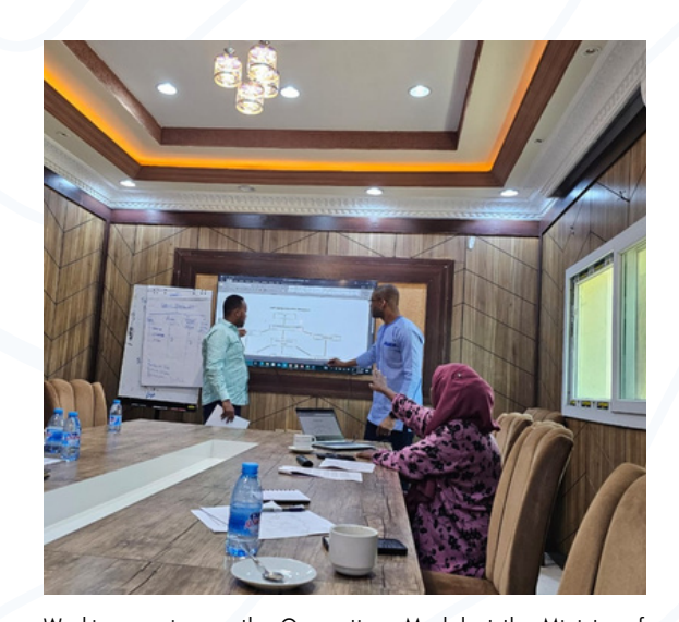
Working session on the Corrections Model at the Ministry of Justice & Constitutional Affairs (MOJCA) in Mogadishu, Somalia. From left to right: MOJCA Director of Corrections and JCSC Corrections Officer (standing) and MOJCA Director of Planning (sitting).

Between January and March, a JCSC Corrections Officer temporarily assumed the role of Chief Corrections Officer to prevent critical gaps and ensure continuity, especially regarding the finalization of the corrections model within the framework of the constitutional reform process in Somalia. The deployment resulted in a concept note on demilitarizing the Custodial Corps and implementation of the Federal Corrections Model, which was adopted by the Federal Government, as well as a joint review of the Prison Law, in collaboration with UNODC.