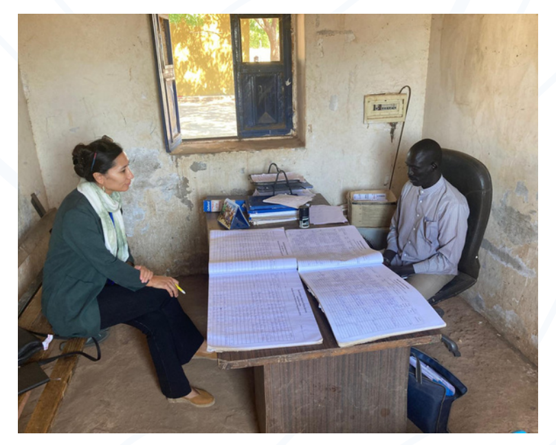
JCSC Judicial Affairs Officer with the State Police Investigator in Bentiu, Unity State, South Sudan.

Between October and December, a JCSC Judicial Affairs Officer supported UNMISS on a Norway-funded project focusing on advancing accountability for sexual and gender-based violence and conflict-related sexual violence in hot spots of South Sudan. Based on a desk review and field consultations, the JCSC Officer assessed progress, advised on monitoring, evaluation and planning and prepared an impact report summarizing results, key challenges and next steps. This report will also serve as an advocacy and resource mobilization tool.