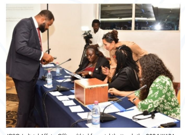
JCSC Judicial Affairs Officer (third from right) attends the 2024 WABA Conference in Benin.