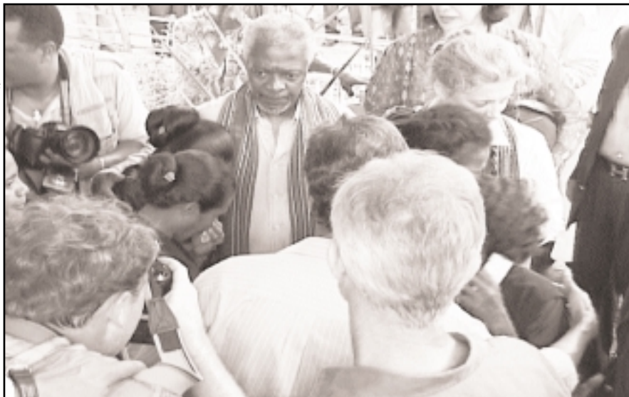
United Nations Secretary-General Kofi Annan comforts families members of those slain last April in a Liquica church.