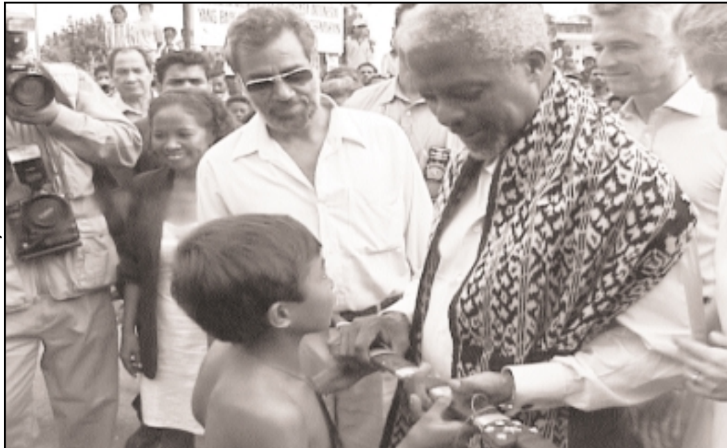
United Nations Secretary-General Kofi Annan receives a traditional sword (surik) during his first official visit to East Timor.

The Secretary-General added that in his talks with the region's leaders prior to his arrival in Dili, "each expressed a willingness to help and each recognized that East Timor is an important part of the region."