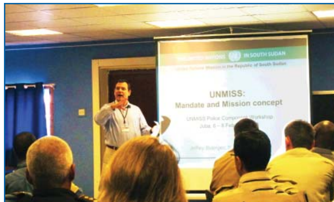
SPC Legal Adviser delivers a presentation on UNMISS' mandate and mission concept during the UNMISS Police Component Workshop held on 6-8 February 2013.