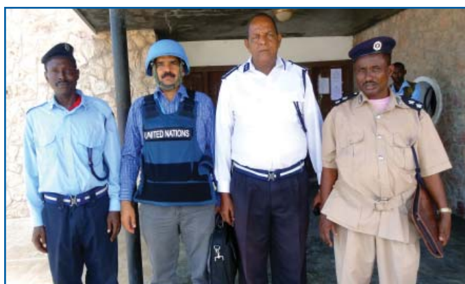
SPC Team Leader (second from left) with the Somali Police Force officers during a visit to a police station in Mogadishu.