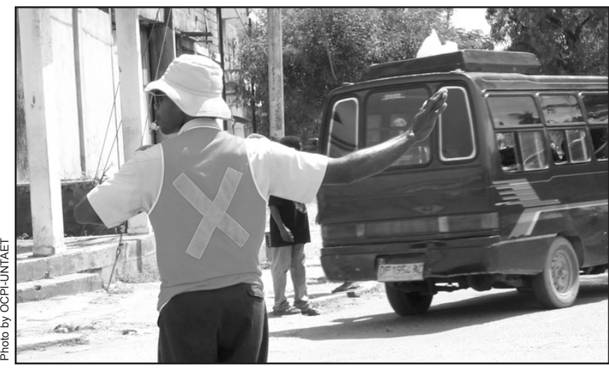
A Dili traffic warden brings some order to the city's streets.

Radio Timor Kmanek is produced by the Catholic Diocese of Dili and is broadcast throughout Dili and in large portions of the country.