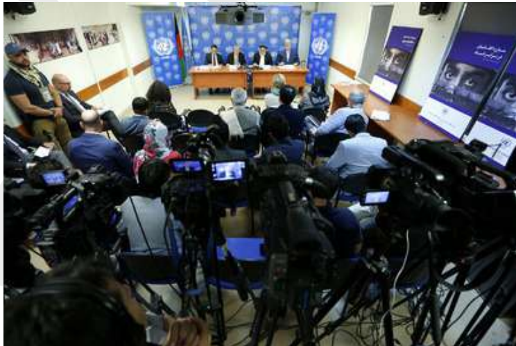
Press conference on the launch of the new anti-corruption report on 25 April 2017

A key component of Afghanistan's criminal accountability architecture is the new national Anti-Corruption Justice Centre (ACJC) , which was established by Presidential Decree in June 2016 and officially opened on 23 August 2016, with the support of UNAMA and the United Kingdom's DFID and Resolute Support (NATO+) Mission. The ACJC's first primary trial case was adjudicated in November 2016. Its specialized police and prosecution units, and a national primary and appeals court, operate Afghanistan-wide with jurisdiction over a broad range of serious corruption offences.