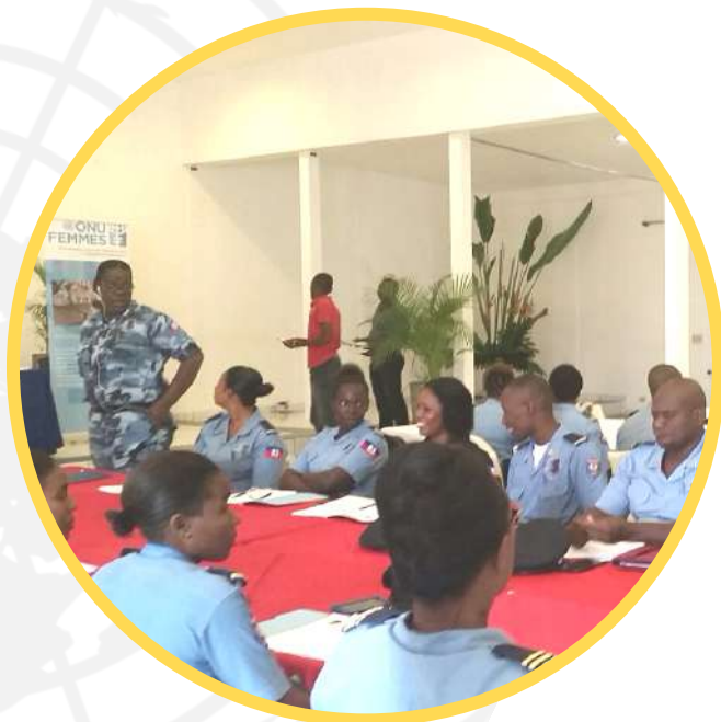
Workshop on corrections issues in Haiti

MINUSTAH will continue to work with the DAP to implement the strategic plan, promote gender equality and tackle gender-based discrimination and violence.