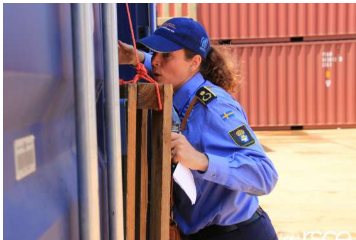
GPP developing their skills at the corrections training in Entebbe, Uganda