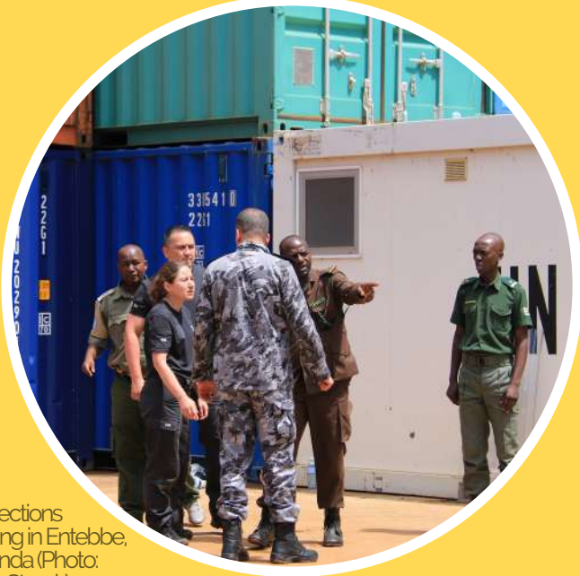
Corrections training in Entebbe, Uganda

JCS supports the important work of justice and corrections components in United Nations peacekeeping and special political missions around the world. Together, we provide support to host countries to deliver basic justice and prison services, strengthen criminal justice systems and facilitate rule of law reforms, with the objective of advancing stabilization and security, the protection of civilians and accountability for serious crimes that fuel conflict.