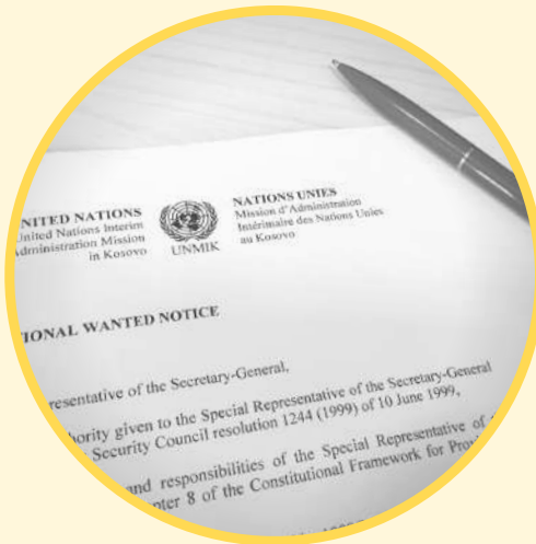
Draft International Wanted Notice to be issued by the Special Representative of the Secretary-General for Kosovo

UNMIK also works closely with the International Police Organization (INTERPOL) to facilitate the interaction of Kosovo authorities with INTERPOL Member States. Kosovo authorities can request the issuance of an International Wanted Notice in respect of someone who is believed to be outside out of Kosovo and is required to appear before a Kosovo court or serve a prison sentence. They can also request that a protest be lodged concerning notices issued by other jurisdictions.