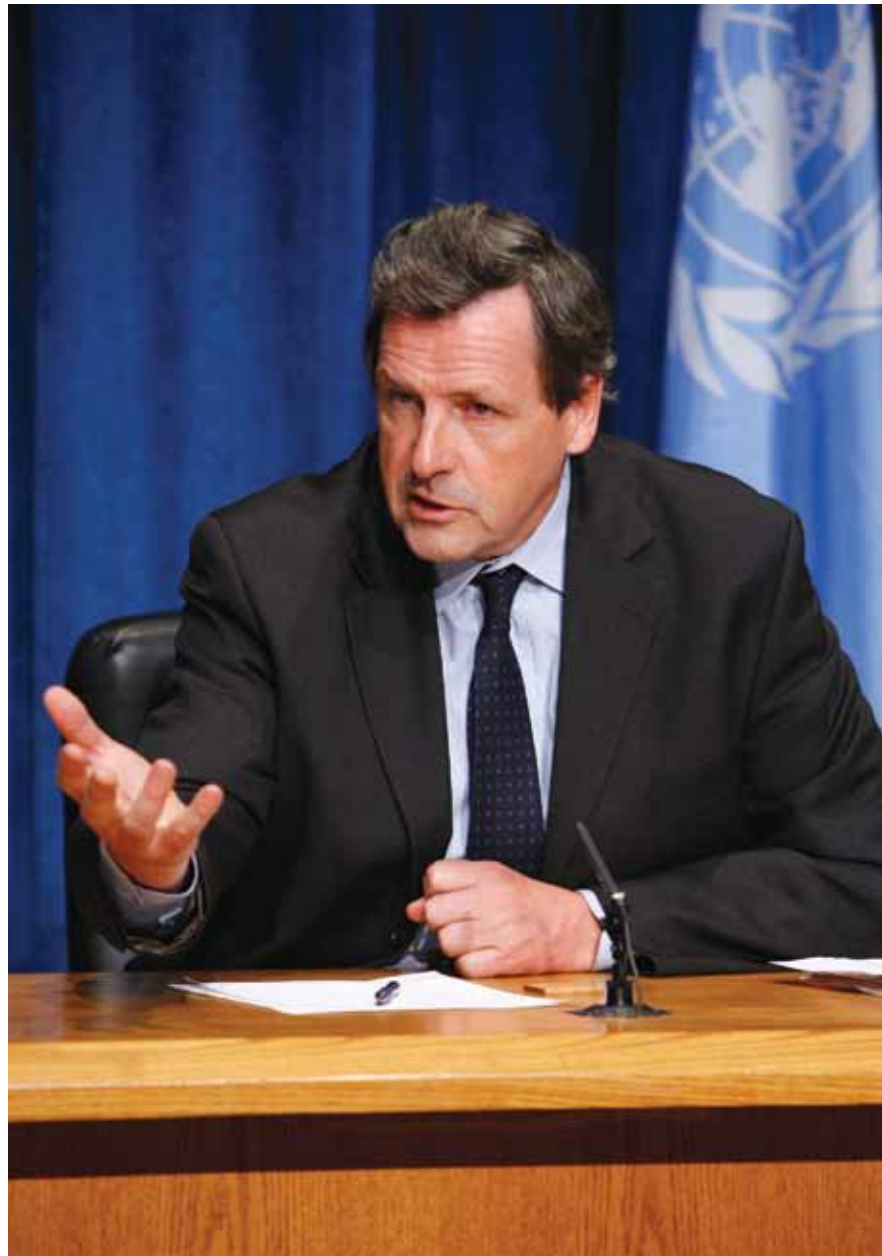
Mr. Alain Le Roy.

In March 1990, the Security Council expanded the mandate of the peacekeeping operation known as ONUCA to demobilize anti-Government elements in Nicaragua, among other tasks. In the past two decades, DDR has played a central role – along with elections – in the mandates of peacekeeping operations. But DDR practices – just as peacekeeping operations themselves – are changing and evolving. The publication of “Second Generation DDR Practices in Peace Operations” in June 2010 made it clear that DDR can take different shapes and forms – including labour-intensive projects providing alternative livelihoods to gang members in Haiti or disbandment of illegal armed groups in Afghanistan. As with the larger challenges of peacekeeping, in which DDR plays an integral part, the issues have become more complex over time. In order to better serve our clients – the host countries and our colleagues in the field – the whole United Nations system has to keep innovating and improving. There will still be major DDR challenges ahead – especially in the DRC and Sudan, including Darfur. I encourage the DDR Section in OROLSI/DPKO, together with the Inter-Agency Working Group on DDR, to continue to develop, evolve and get stronger as a centre of excellence.