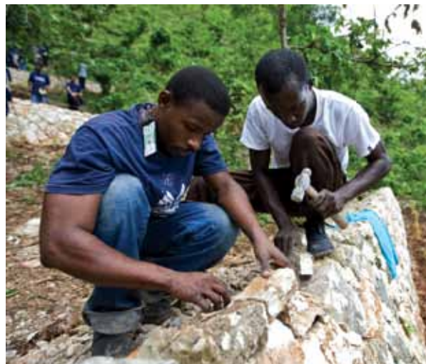
MINUSTAH's CVR Watershed Management Project.

Community leaders in Bel Air, one of the toughest areas in Port-au-Prince, renewed their commitment to reducing violence in the greater Bel Air area, which includes parts of Cité Soleil, with the signing of a local peace accord on 29 May 2010. "Tanbou Lapè" in Creole, or Peace Drum, initi-