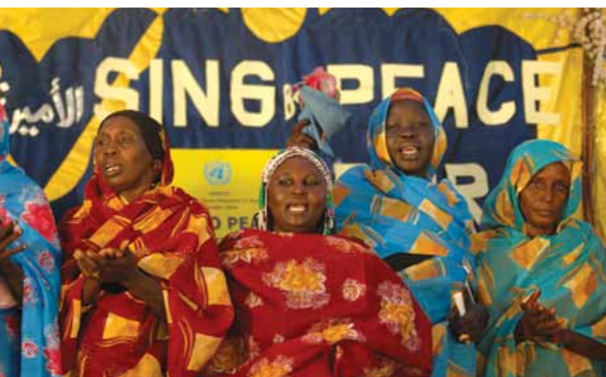
The Hakamas, a group of women who during war time travelled with the troops and sang war songs, perform at UNMIS HQ as part of their “Sing for Peace and DDR in Sudan” programme.