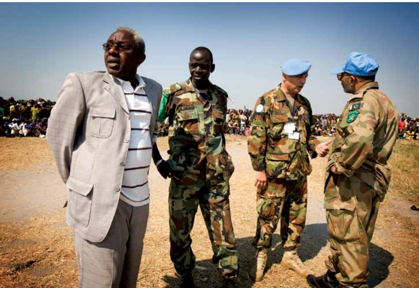
22 June 2009, demobilization site for ex-FNL combatants, Rubira.

DDR processes involve a wide range of actors and donors, each with their own and diverse basic assumptions and mandates. Facilitating the coordination of all these parties, while also respecting Burundian and regional political leadership in a uniquely African-led series of disarmament processes, posed a significant challenge. The Mission's establishment of a joint DDR-SSR unit, BINUB's participation in political and technical Ceasefire Agreement Implementation mechanisms, donor coordination, and close integration with UNDP, allowed BINUB to forge necessary, but often missing, institutional links.