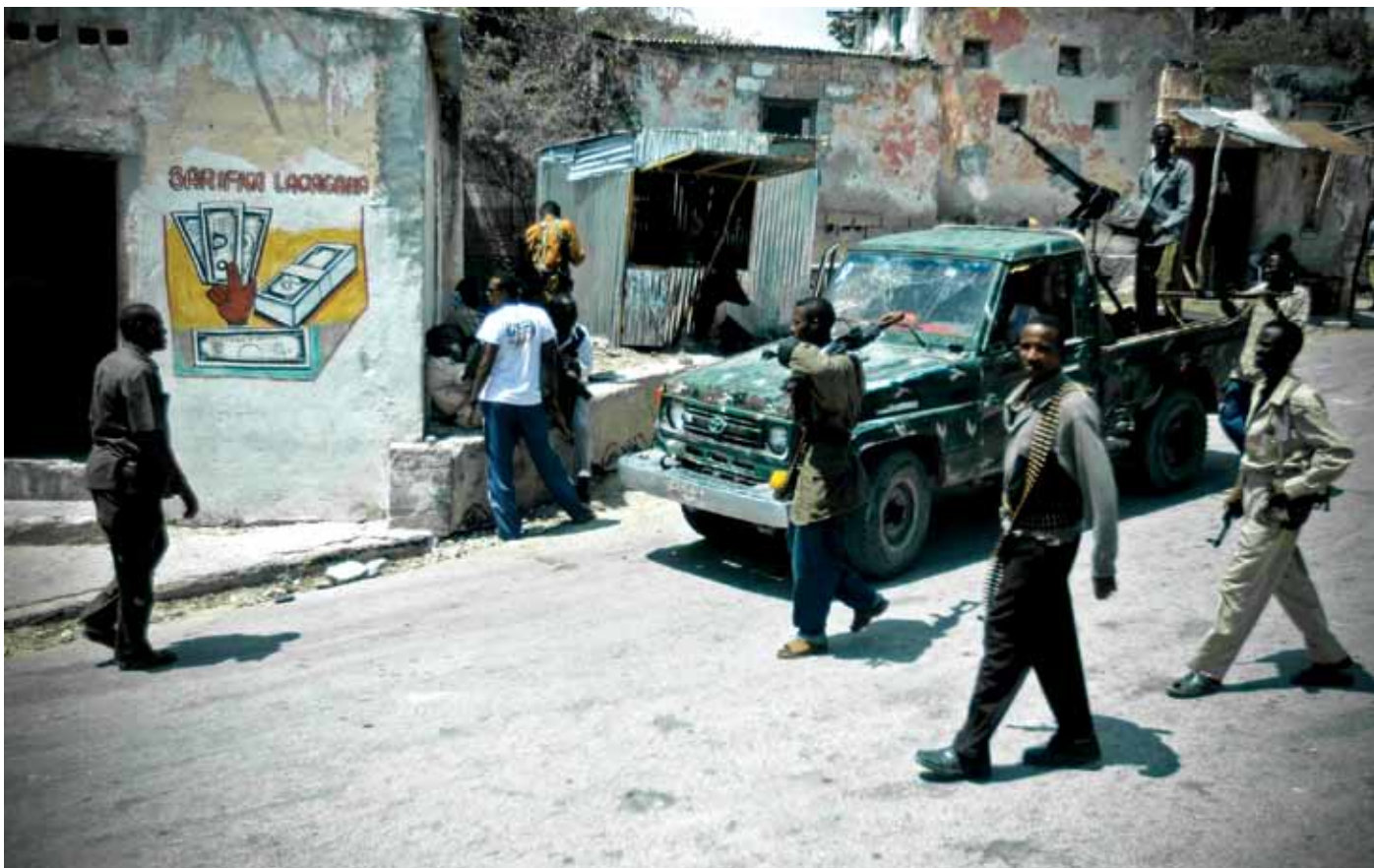
(Stuart Price/Albany Associates)

In 2010, the security situation in Somalia remains extremely volatile, with a number of Islamist armed group elements continuing to launch attacks in south central Somalia on the Transitional Federal Government (TFG) and its forces. The African Union force supporting the TFG, AMISOM, increased its deployment to 6,000 Ugandan and Burundian soldiers with UN assistance. The criteria for the deployment of a UN peacekeeping operation, presented in the Report of the Secretary-General on the situation in Somalia (S/2009/132) of 9 March 2009, have not yet been met. In this environment, of course, the conditions did not exist either for implementing a conventional DDR programme. Given the particular culture of gun ownership and the range of target groups – from clan-based and factional militia to armed groups established by businessmen – a “Second Generation” community-based approach to DDR may prove best in the Somalia context. One possible starting point may be the several hundred opposition fighters that have left the armed groups, some with weapons and others without.