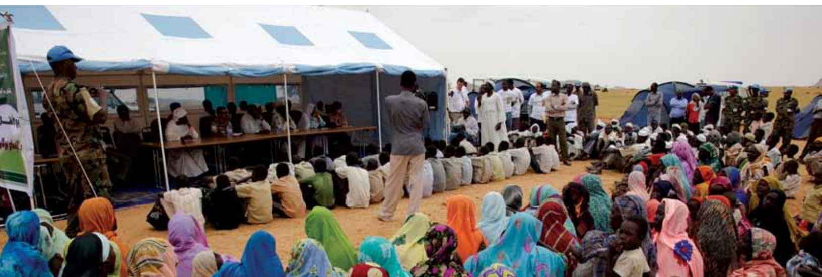
26 July 2009 El-Fasher: DDR programme for the demobilization of 25 child soldiers in Tora, Northern Darfur.