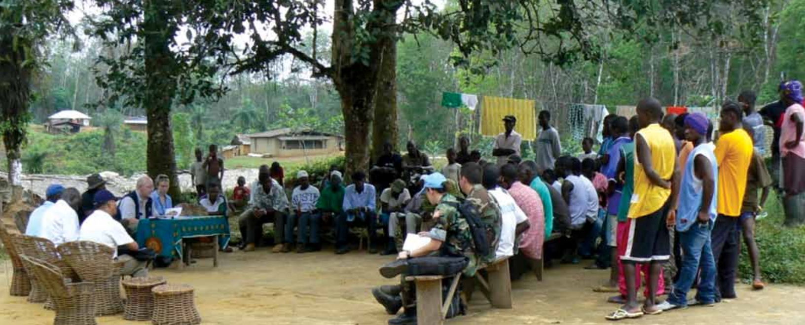
Sinoe Rubber Plantation.