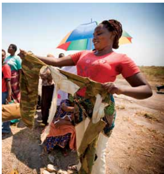
22 June 2009, demobilization site for ex-FNL combatants, Rubira.

DDR is not arms collection : “One Combatant-One Gun” eligibility programmes will not effectively assist in achieving peace in insecure environments. The key is to dismantle armed groups’ chains of command regardless of the number of arms collected.