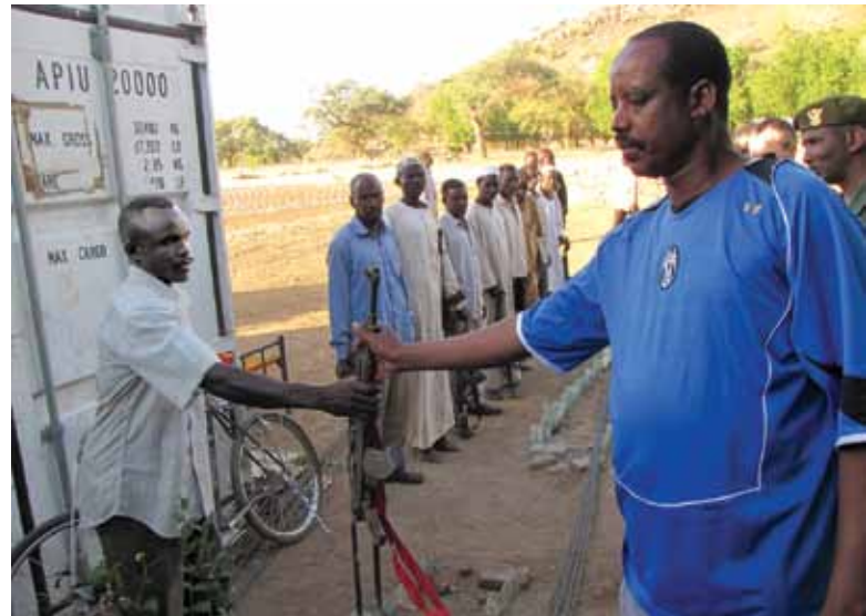
Combatants of the Popular Defence Force (PDF), aligned to the Sudan Armed Forces (SAF), hand in their weapons prior to demobilization in Kadugli, Southern Kordofan.

While provisions on DDR were included in the 2006 Darfur Peace Agreement (DPA), no formal DDR programme has been established to date due to a lasting impasse of the peace process in Darfur. In the meantime, UNAMID is providing logistical support to UNICEF and the North Sudan DDR Commission responsible for the implementation of the Darfur Child DDR Programme, which started in July 2009.