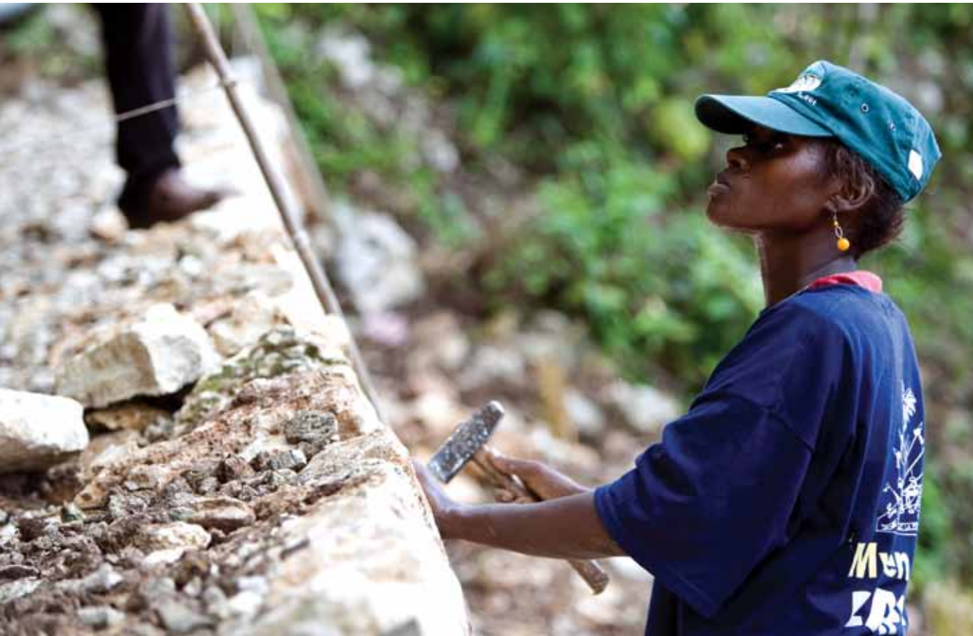
MINUSTAH’s CVR Watershed Management Project.

Who does it and where? In peacekeeping, current Second Generation DDR initiatives include MINUSTAH’s Community Violence Reduction programme and the 1,000 Micro-projects in Côte d’Ivoire. Governments, UN agencies (particularly UNDP) and external partners have a long history of implementing programmes and activities which would fall under the Second Generation concept outline in DPKO’s study.