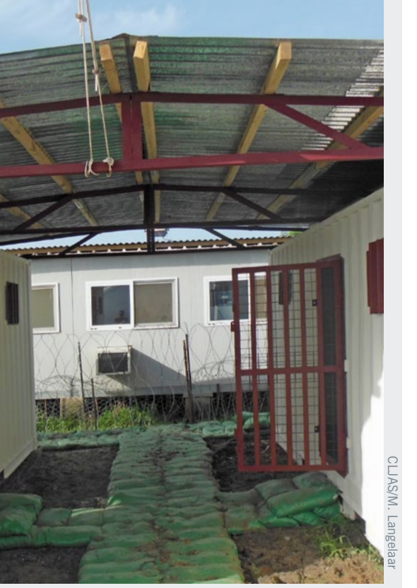
Holding facility in Malakal.

detainee, if released. For those held in longterm detention, the Mission continues to work with NGOs, community leaders and national authorities to find solutions to their long-term detention status.