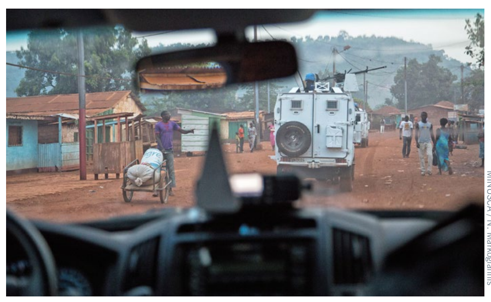
United Nations vehicles moving through the streets of the Central African Republic.

http://www.un.org/en/peacekeeping/issues/ruleoflaw