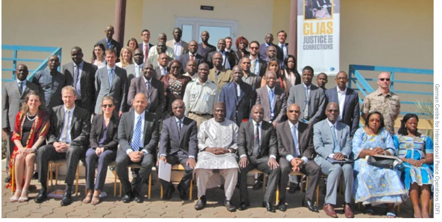
Participants in the DPKO Rule of Law Training Programme for Judicial Affairs Officers in Mali, March 2015.