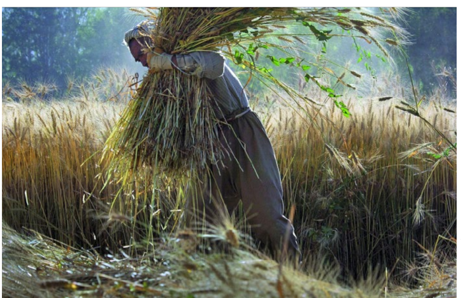
Afghan farmer harvesting his crops.

The three part series "Stolen Lands of Afghanistan and its People" can be found at http://unama.unmissions.org under "Key Documents and Reports".